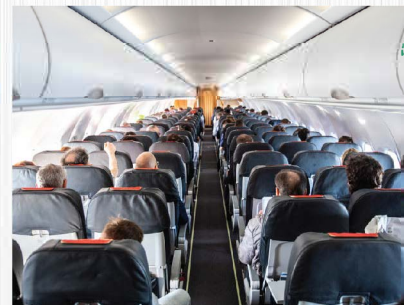
UL FLAMMABILITY RATING