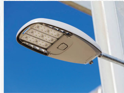
UV & OZONE RESISTANCE